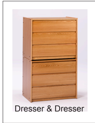
Dresser & Dresser

The following items can also be stacked and arranged to maximize space.